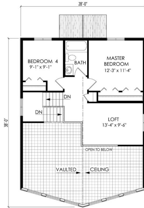
UPPER FLOOR PLAN - 527 SQ. FT. TOTAL - 1,674 SQ. FT.