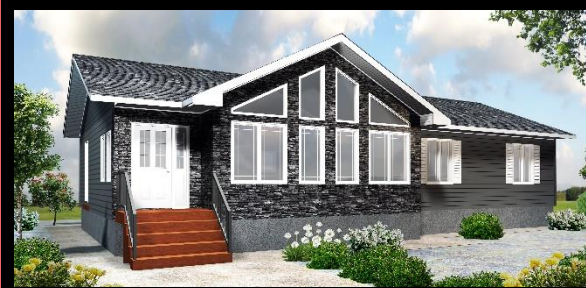
The Catalina 1678 sq.ft. $189,900 Large Master Ensuite!