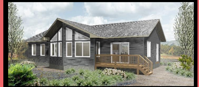
The Evening Star 1358 sq.ft. $159,900 Vaulted Living Room Ceiling!