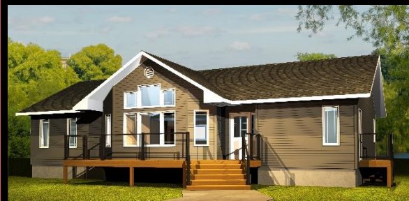
The Crosswinds 1607 sq.ft. $176,900 Bright & Open!