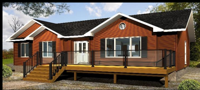
The Kalleigh 1476 sq.ft. $155,900 Vaulted Ceiling!