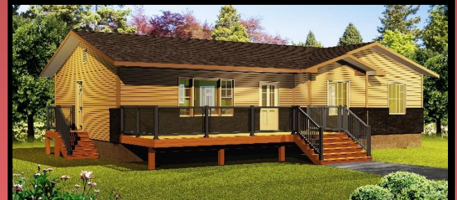
The Harvard 1359 sq.ft. $144,900 Open Concept!