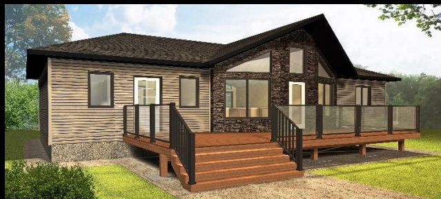
The Suncrest 1531 sq.ft. $179,900 Island Included!